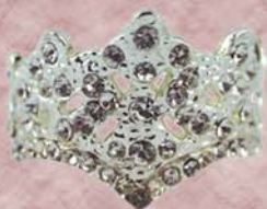
Tiara of Empress Josephine