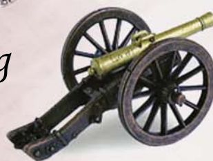
Napoleonic 6 Pound Canon