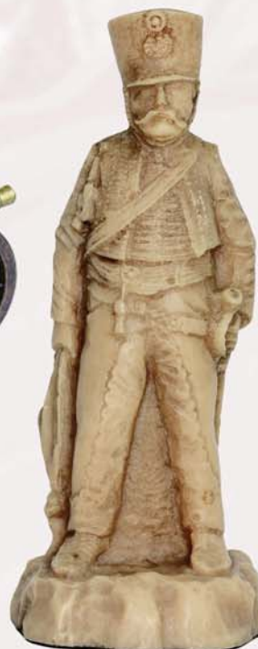
Resin Figurines Grenadier of The Guard