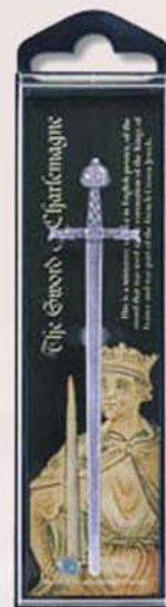
Sword of Charlemagne