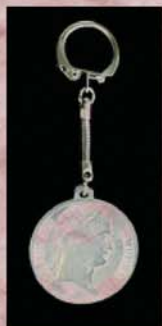
Keyring 1808 Napoleon 5 Francs