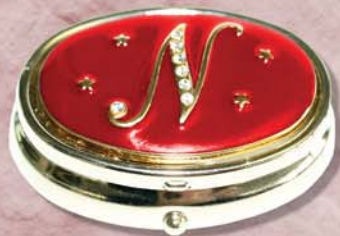
"N" Monogramme Pill-Box