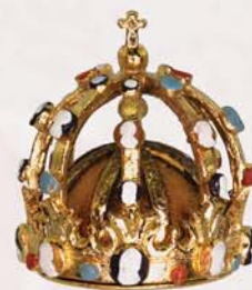
Crown of Napoleon