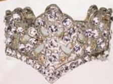
Crown of Napoleon & Josephine